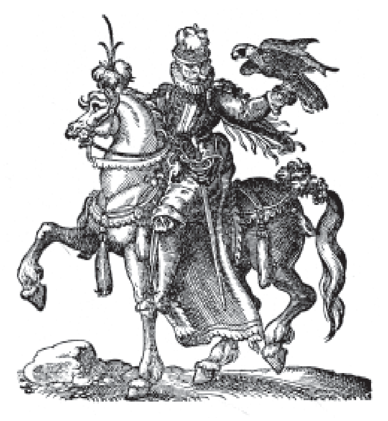
Center for Medieval and Renaissance Studies The Ohio State University November 2003