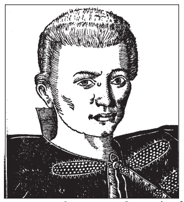
The Pretender Dmitri Ivanovich (1605)

This lecture examines the central figure in "Russia's first civil war" -- the young man who claimed to be Ivan the Terrible's youngest son Dmitrii. Whoever he really was, Dmitrii was the only tear to come to power by means of a military campaign and popular uprisings. His true identity, shortreign, and significance in Russian history are still hotly contested issues.