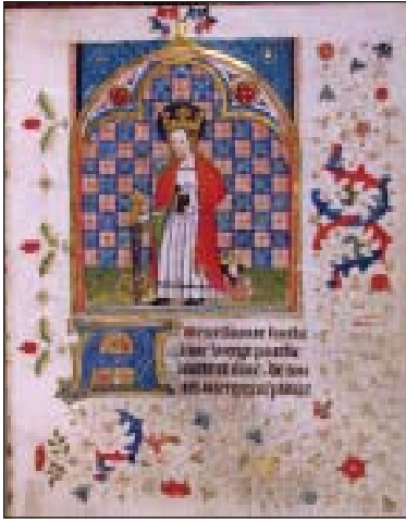
Fig. 1. An illuminated portrait of Saint Catherine of Alexandria, c. 1400 (SPEC.MS.FR.1).

possibilities. Researchers studying saints' lives, for example, may be interested in La Vie de madame Sainte Katherine, dicte en vers francois , a late fourteenth- or early-fifteenth-century life of Saint Catherine of Alexandria, featuring an illuminated painting of the saint (Fig. 1). Scholars of religious history may wish to examine a prayer book dated 1338 belonging to one Cardinal Gottius Battaglia. Although measuring only 9 cm, the manuscript is elegantly illustrated, a fine example of a personalized, pocket prayer book (Fig. 2). Researchers interested in popular medieval theological works may want to