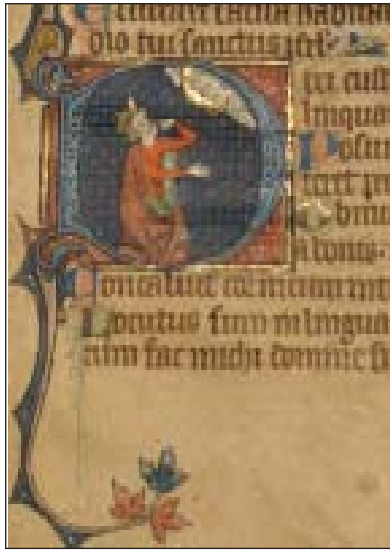
Historiated initial D with David pointing to his mouth from a thirteenth-century English Psalter (OSU SPEC.CMS.113).

Center for Medieval and Renaissance Studies The Ohio State University February 2007