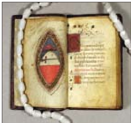
Fig. 2. An opening from Cardinal Gottius Battaglia's prayer book (1338) featuring his coat of arms (SPEC.MS.LAT.13).

paleography and manuscript production. Moreover, a great many of the leaves are richly illustrated, providing fine examples of manuscript decoration. Indeed, the illustration on the cover of this issue of Nouvelles Nouvelles features an historiated initial letter "D" depicting David, the traditional author of the Psalms, from a thirteenth-century English Psalter leaf held in our collection.