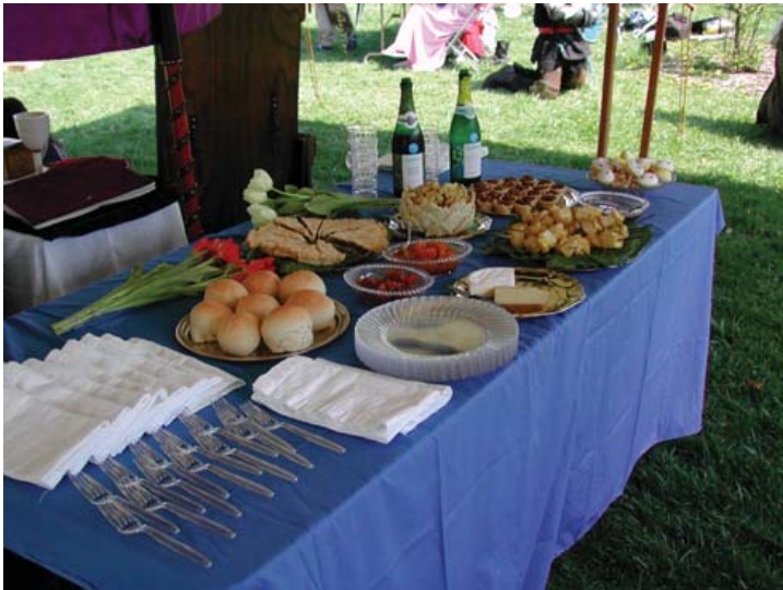
A lunch spread of bread with cheeses and fruit preserves, endored chicken with Lombardy mustard sauce, a dish of artichokes, a pye of beif, rysschews of fruit, and sugared almonds.

The currents referred to in medieval English cookbooks were a type of raisin made from the "Black Corinth" grape, and are not related to red or black cur-