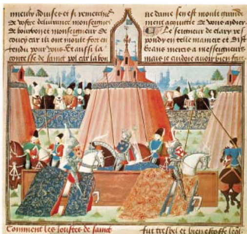
101 The scene of St. Iaghuys Geoffrey Chaucer, Chaucer's Works, 1911 c.