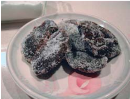
Salted venison steaks

As to where it's going, I'm not exactly sure. I know I'll be adding more of the same: increase the number of available medieval cooking texts, add more recipes, improve the search engine. I'd also like to