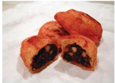
Rysschews of Fruit

I have several cookbooks that are published transcriptions of medieval cooking manuscripts - three or four of which I use regularly, with the rest being more used as research tools. I also make heavy use of the medieval cookbooks that are available online.