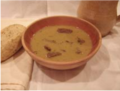
Bukkenade (beef stew)

re-enactment groups. These groups are a mixed blessing for me. While they do provide a place for me to apply what I've learned and to test theories, the overall level of historical accuracy (among other things)