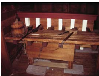
The tools for a demonstration on how to caulk a ship.

Entering the ship from the gangplank on the east side, one looks straight ahead to the main mast, made from a single Douglas fir, and into a hatch dropping down to the hold and bilges below. To one's left, the bow rises up to the forecastle (or foc's'le), which supports the foresail and spritsail. A cavernous, semi-circular space underneath the forecastle forms the front edge of the main deck and hosts the open ship's galley, which is little more than a small stove. To the right, one walks under the quarterdeck, which encloses the aft section of the ship, and enters the steerage, where, appropriately enough, one finds the tiller. A long boom of wood hinged to the rudder, the tiller was operated by simply pushing it in the opposite direction one wanted to go (the ship's wheel had not been invented yet). The steersman would not have been able to see where he was going from the steerage and would have had to shout to the lookouts for directions (which perhaps explains Columbus's erratic route around the Atlantic).