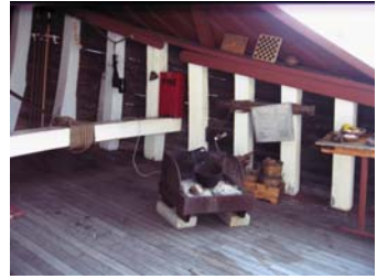
The ship's galley on the main deck.

tours to private parties and over-night historical immersion trips for children. It is operated as a piece of living history, and the exhibits throughout the ship emphasize that fact. In the ship's galley, one can cook a bit of food, while down in the hold a table has been set up with the materials to recaulk the ship if it springs a leak – as it does, though the bottom of the ship is coated with fiberglass in a nod to modernity. An electric bilge pump keeps the boat clear of water, but a period pump is also set up for people to use. A small ship's canoe is tethered to one side of the ship and occasionally does cargo duty, acting its part in demonstrations of how the ship was loaded and unloaded.