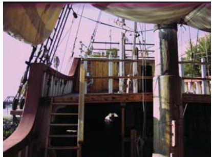
A view of the quarterdeck, steerage, and captain's cabin.