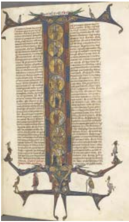
2008.2- Gothic Bible (Vulgate) Genesis with full-length initial I Credit: John L. Severance Fund, Cleveland Museum of Art

The Gothic bible was likely produced and illuminated in Toulouse in the last quarter of the thirteenth century and remains in excellent shape. The quarto-sized manuscript has been rebound over the years but remains entirely intact and includes both the Old and New Testaments in the same volume, one of the earliest types of bibles to do so. The manuscript displays a mixture of delicate care and heavy use (likely in church services): The pages are fairly clean, with only the occasional spot or corrective marginalia, and the script is a medium reddish-brown; on many of the edges, though, one can see the creases left by fingers as the pages were turned.