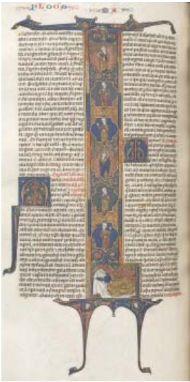
2008.2- Gothic Bible (Vulgate) Tree of Jesse, with initial L

think the average visitor experiences a level of familiarity as well as intense curiosity about medieval objects in a museum context. Many will have already some familiarity with a stained glass window, a gothic sculpture, or an illuminated manuscript through art books, novels, film and a host of ephemera such as calendars and postcards. While they may not have knowledge, they are somewhat familiar and extremely interested. I find that there is a responsiveness to the objects and the period. I would also suggest that any works of art that have antiquity, which includes works of medieval art, captivate by sheer age. Separated by centuries, by countless generations, I think visitors are fascinated to see complex and delicate objects such as an ivory diptych or an Ottonian gilt-silver reliquary, and to know that these works were made by human hands separated from them by an immense period of time.