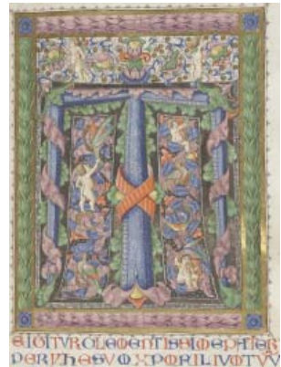
2006.154- Missal Decorated initial T, 1469 Credit: John L. Severance Fund, Cleveland Museum of Art

Manuscripts can offer abundant evidence of medieval artistic techniques and the evolution of medieval art. “Illuminated manuscripts survive in the greatest numbers of any type of medieval art” despite their functional nature, Fliegel said as he discussed the two manuscripts in one of the back rooms of the museum. The museum acknowledges the literary aspects of manuscripts, of course, but that is not why it bought these two, Fliegel said. “We are, of course, a visual arts museum. The artistic