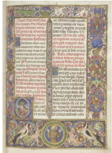
2006.154- Missal Ordo Missalis, with full borders

a German. This manuscript too is complete, and is closely connected with the Franciscans. The opening page is richly illuminated with cherubs, animals, and vegetation, and the bottom center is a wreathed medallion of St. Francis, who displays the stigmata on his hands. The masterpiece of the manuscript is a vast, full-page illumination of the Crucifixion that displays St. Francis, once again with the stigmata, kneeling below the cross and hugging one of Christ's feet. An only slightly smaller illuminated T occupies the facing page. Beneath that T, one can see a smoother streak across the page of the manuscript, where the priest's hand would have rested with the manuscript open on the altar before him.