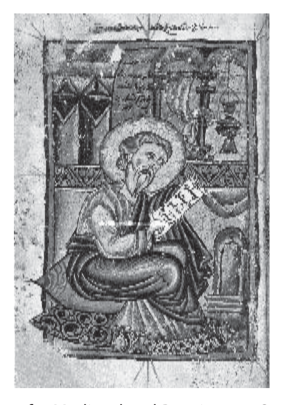
Center for Medieval and Renaissance Studies The Ohio State University October, 1998